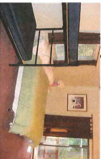
6 bunks & 1 Queen per room